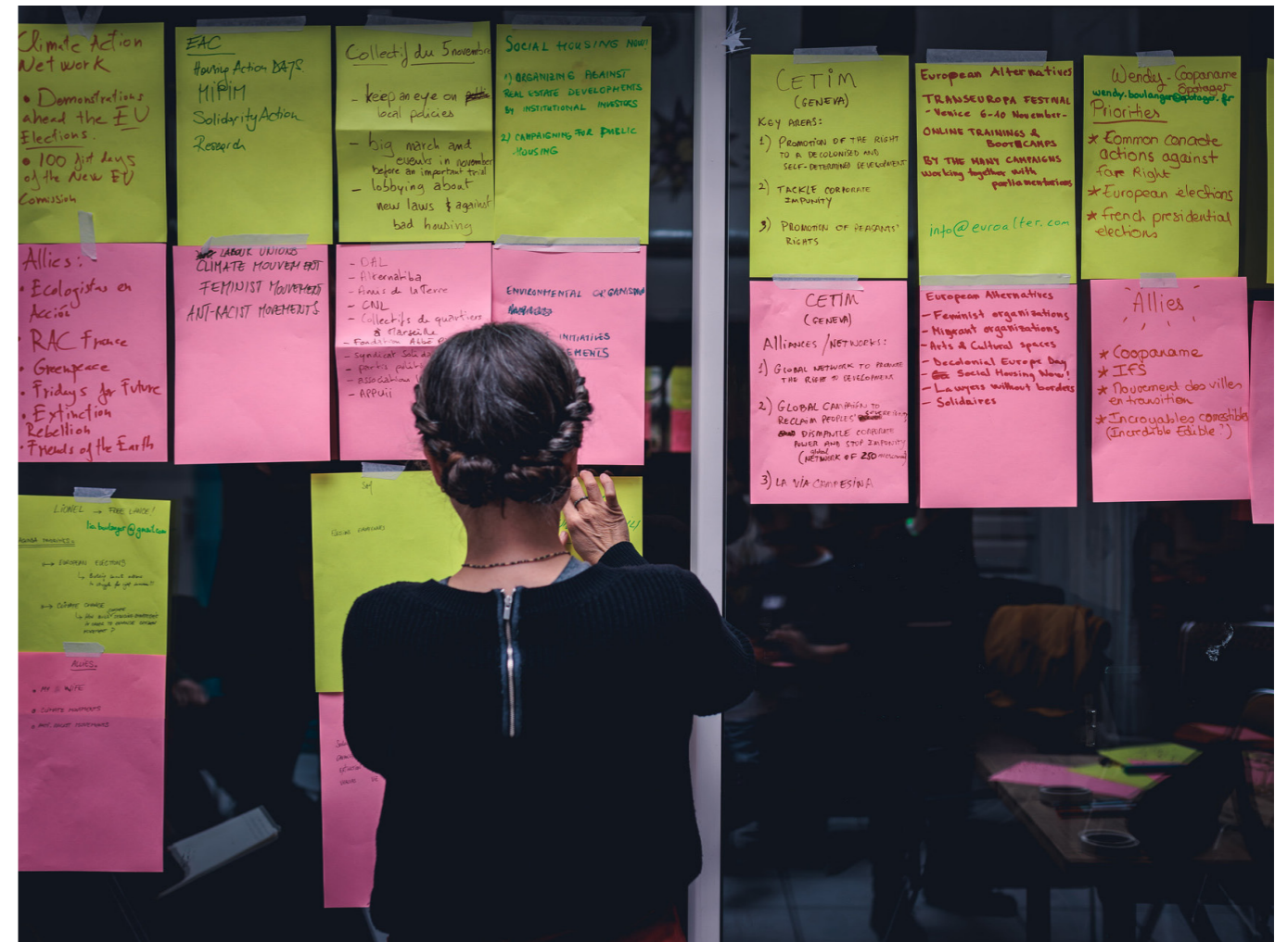
European Common Space for Alternatives. Workshop in Marseille (2024)

Private: Volkswagen Foundation, Porticus Foundation, Allianz Foundation.