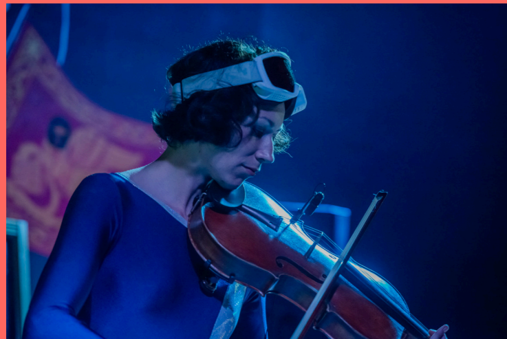
TRANSEUROPA Festival 2024 in Venice - Opening exhibition Water Bodies at CREA