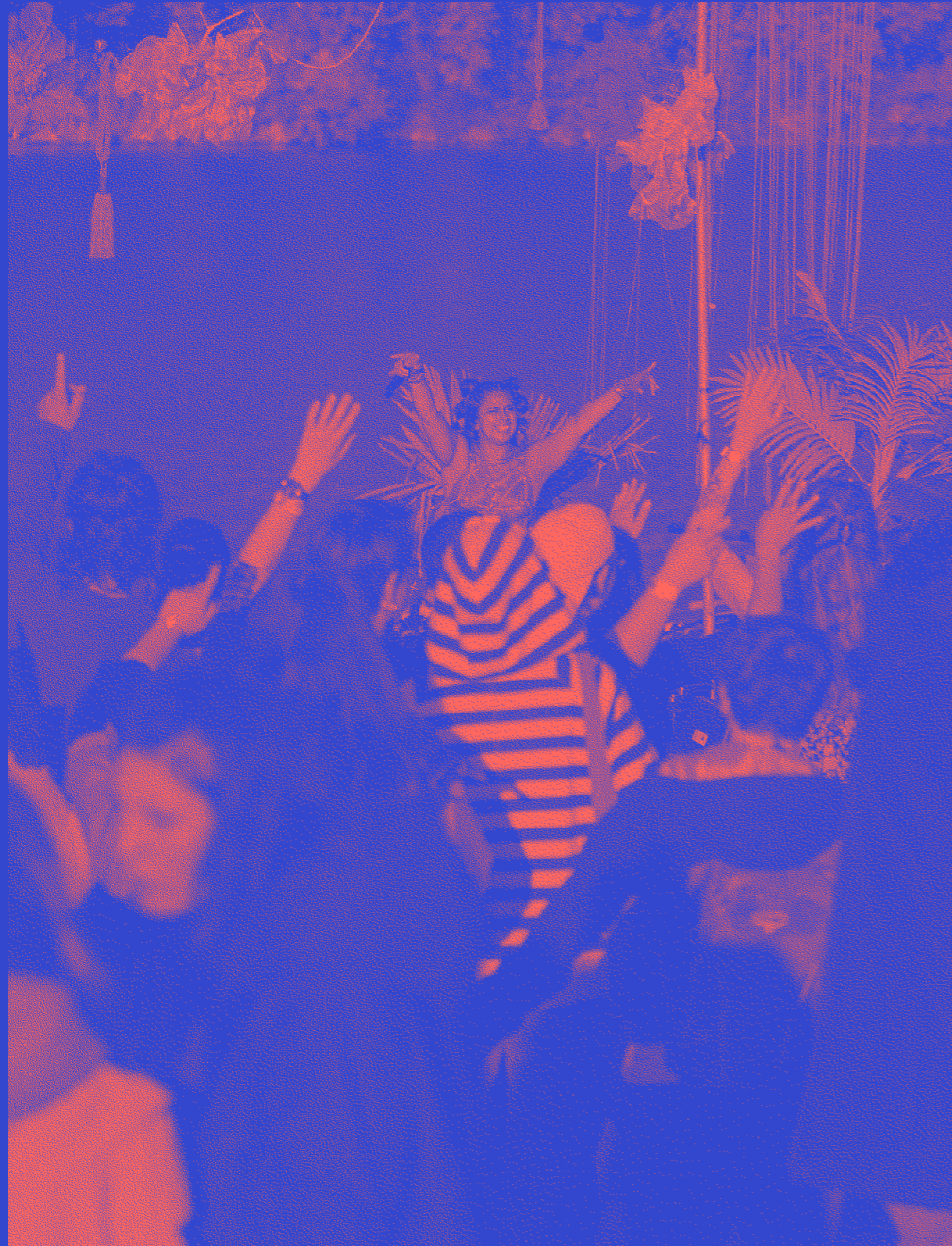
FLUCTUATIONS FESTIVAL in Lille (2024)

The projects and initiatives of European Alternatives are categorised and relate to the different streams. The list of project active over 2023 and 2024 are the following: