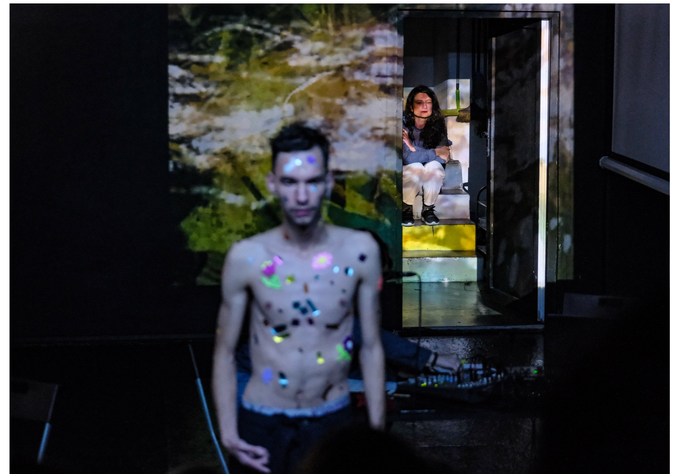
TRANSEUROPA Festival 2023 in Cluj - Artistic performance

The motto of 2023's edition was Holding Spaces. Holding spaces is important not only in a physical sense, but also in a symbolic sense. It is important to re-examine the values that are important to us and that should reclaim not only physical spaces, but also virtual spaces and meta spaces. We must reclaim not only the spaces of our habitat, but the space of discourse, the space of understanding, the space of caring, the space of learning, the space of change.