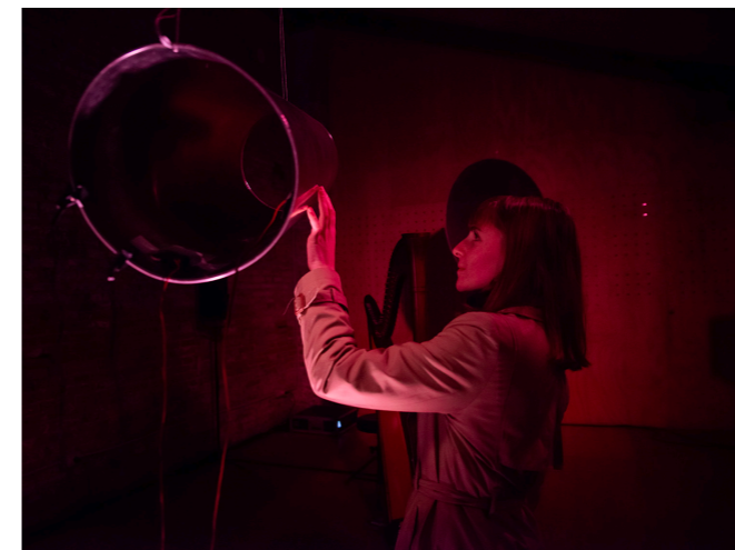
Currents of Memories (Workshop) at PASE in the context of TRANSEUROPA Festival 2024 in Venice

Adopting a bottom-up approach, FIERCE relies on a systematic construction of eight case studies and a comparative dimension-driven analysis of the way debates and controversies on gender influenced the dynamics and output of the policy process. The countries are Denmark, France, Greece, Turkey, Italy, Poland, Slovenia and Spain.