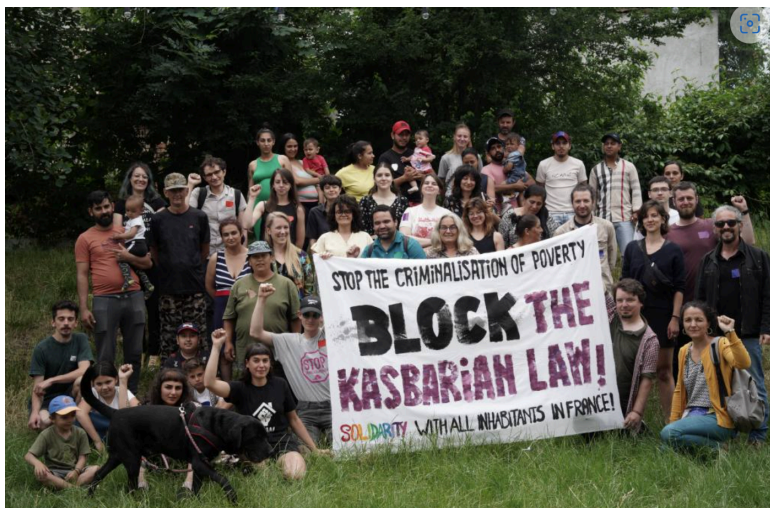
Caption: Housing activists in Cluj stand in solidarity with activists in France resisting draconian new housing laws and the criminalization of squatters, tenants and workers in France. Transeuropa Festival will feature debates and discussion on the crucial question of housing rights.