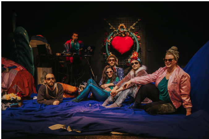
Caption: Theatre collective REACTOR in their performance of 'Part 1. Love'. REACTOR will perform at Transeuropa Festival on the evening of Thursday 12 October.