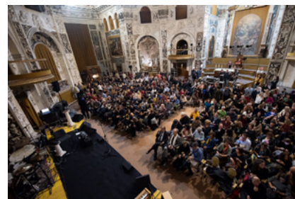
THE MAYFIELD concert with Heinner Goebbels in the Chiesa del Santissimo Salvatore