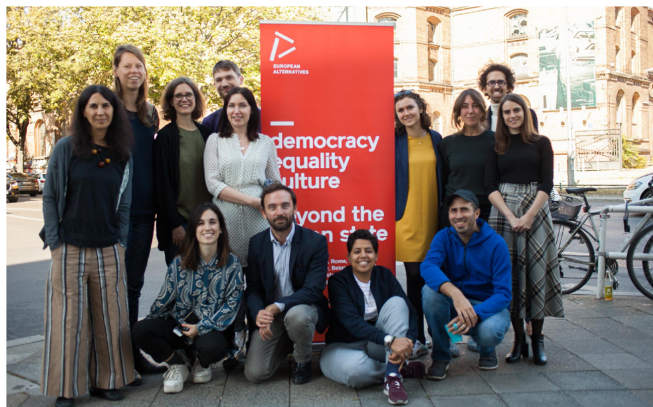
Team of European Alternatives in the Annual General Assembly in Berlin 2019.

In this report you can read about the projects, programs and campaigns we have led with our partners and members in 2019 and 2020. You can also read about how we measure our progress as we continue to build this organization, and what strategic objectives we set for the coming years.