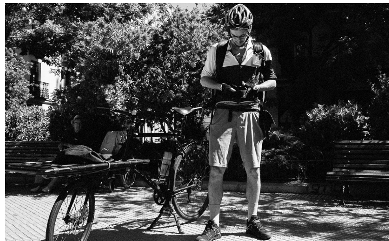
Meeting a rider in Madrid as part of our project Workers Without Borders.