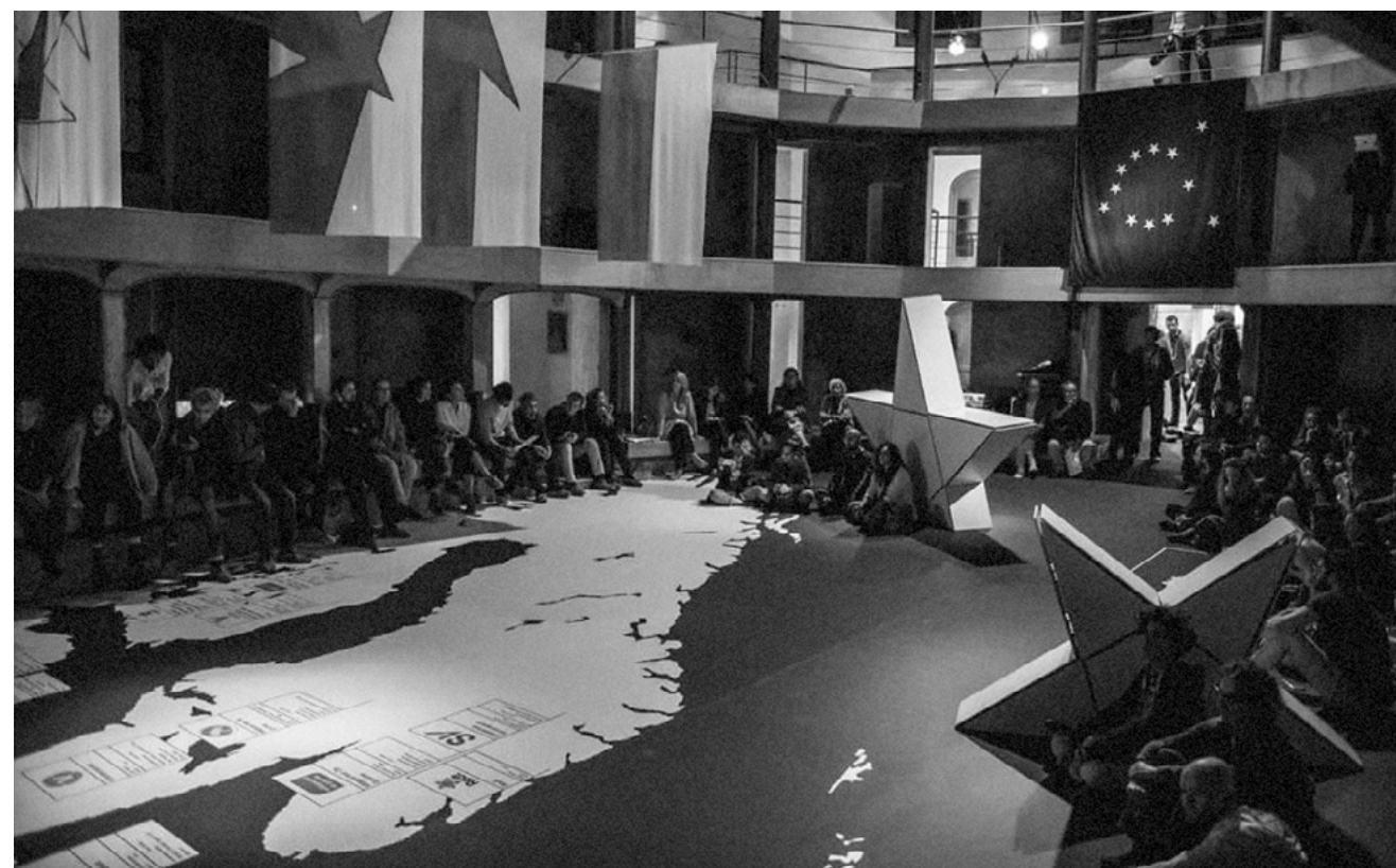
Transeuropa Festival 2019 – BAM UberMauer in Palermo 2019. Preview exhibition New Unions by Jonas Staal.