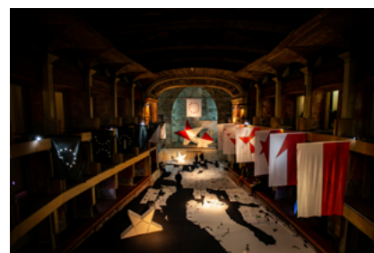
New Unions, Installation – Jonas Staal for Transeuropa 2019 inside Teatro Garibaldi (Palermo).