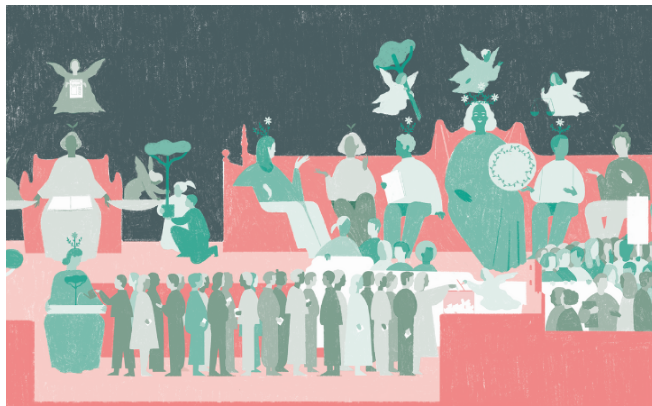
Illustration by Marina Fernández inspired by the famous Allegories of Good and Bad Government painted by Ambrogio Lorenzetti to help illustrate the positive and negative scenarios for Europe's future. The illustration is part of our policy report for the Euryka project.