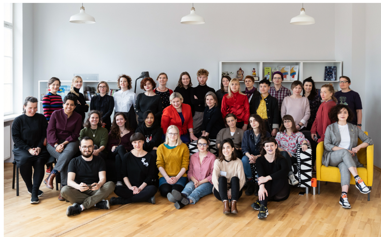
Team of ArtGora Forum in Riga 2019.