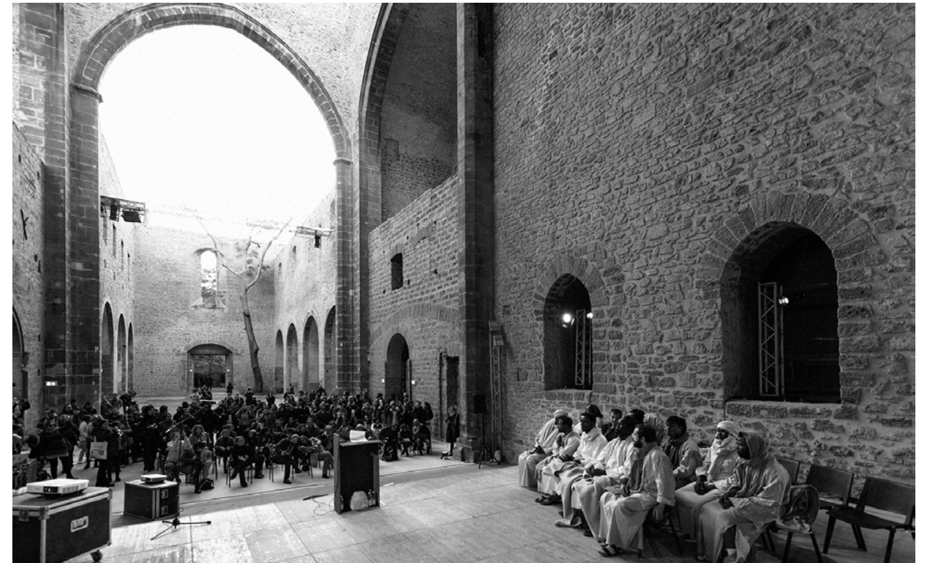
Closing assembly and performance at Spasimo as part of The New Gospel by Milo Rau and his team.