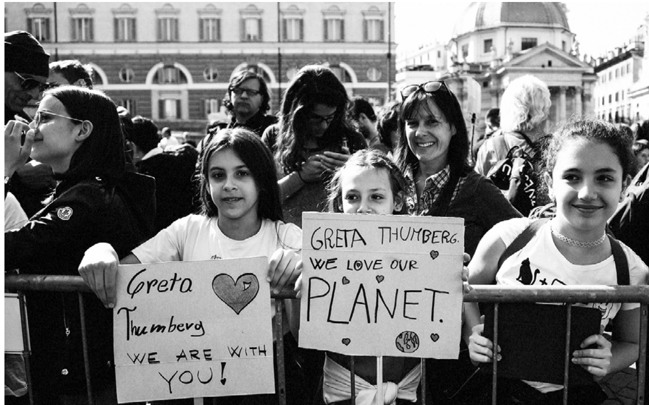
Fridays for Future demonstrations in Rome.