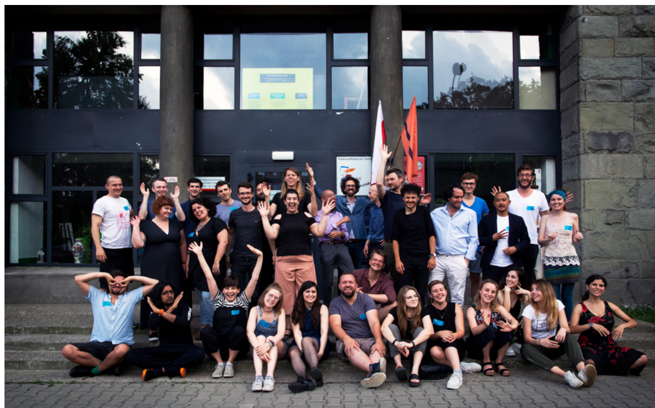
Members of the School of Transnational Activism in the first trainings in Warsaw.