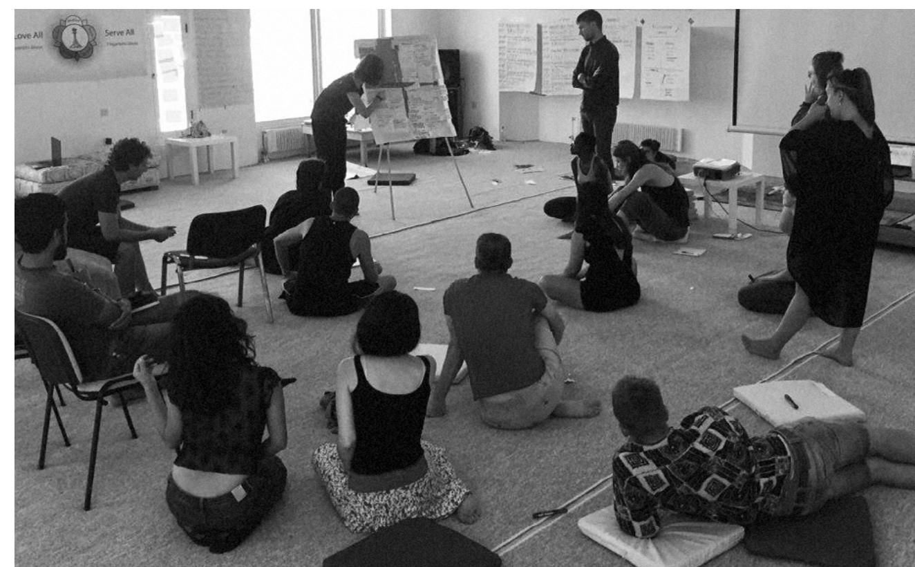
Second workshop of the School of Transnational Activism in Athens.