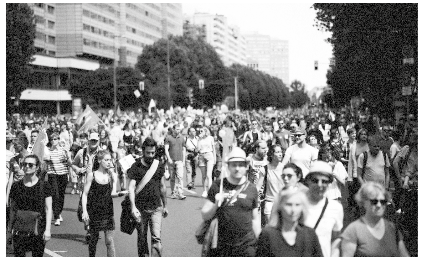
Demonstration March for Europe in Berlin 2019.