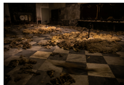
Exhibition "TENTACLES IN SICILY - SCRATCHING THE SURFACE" by KG AUGENSTERN. Curated by N38E13 in the context of Transeuropa 2019