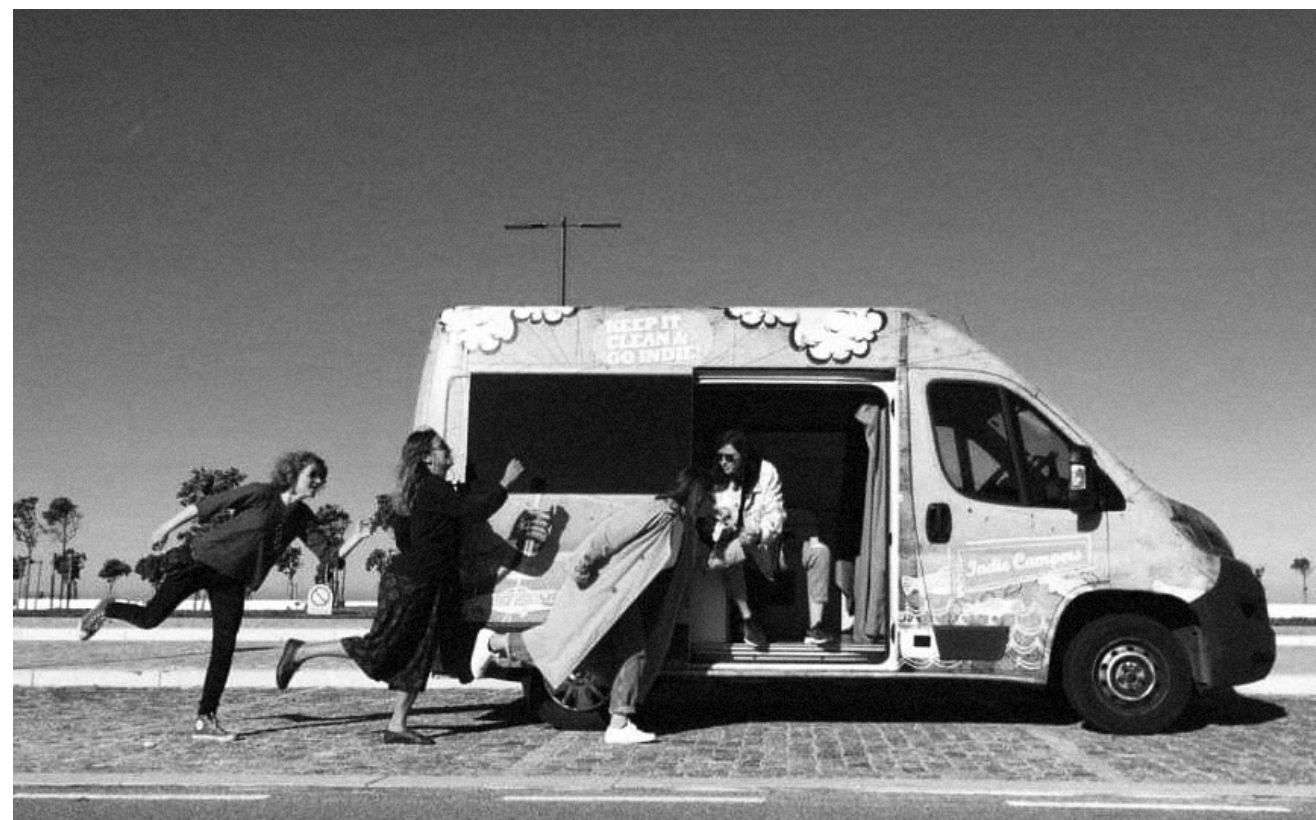
Team of the Western caravan of Transeuropa Caravans traveling across France, Spain and Portugal ahead of the EU elections 2019.

On a Baltic Route, one across Central Eastern Europe, on the Visegrad region, all through the Western countries or around the Mediterranean: the many initiatives that the five Transeuropa Caravans visited told the stories of common struggles and victories. Initiatives that share a sense of community, spirit of solidarity; from resistance to fascism to innovative ways of local participation at municipalist experiences. From the protection of the environment, to the opening of walls and welcoming initiatives for migrants. It is that growing network of interactions across borders, which is motivating people to find alternative ways for building a just and sustainable response for Europe. Looking across the many different cities and initiatives encountered by the Transeuropa Caravans, there is a clear drive to open spaces together that respond to people's needs, give freedom to the imagination, and enable new ways to prosper despite cuts to the social system.