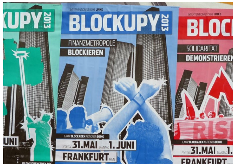
The Blockupy protests in Germany called for ‘real democracy’ in Europe

In order to achieve more meaningful democracy at local levels, it is also crucial to address the ‘democratic deficit’ of the EU. Already there are proposals for a more democratic European parliament coming from President Macron, the Italian government and the German socialist party as well as from the Parliament and Commission. It must be acknowledged that in recent years since the Lisbon Treaty, the European Parliament has been significantly empowered, now having equal decision-making power to the European Council over most issues.