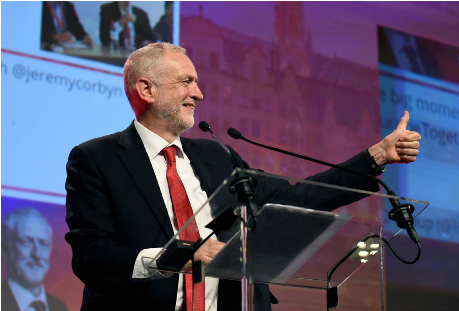
Jeremy Corbyn speaks at a conference organised by the Party of European Socialists (PES)