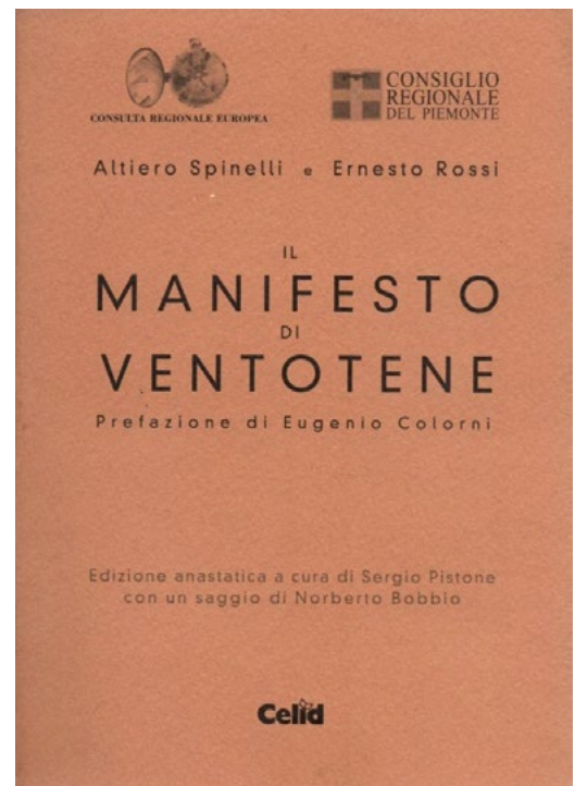
The Ventotene Manifesto, written by anti-fascist activists during the Second World War, was an early vision of a socialist Europe

In the first two decades after the war, the main mechanism for bringing the people of Europe together was economic and social – coal and steel infrastructure, regional funds, the common agricultural policy. A new wave of Europeanism marked the end of the Cold War, but this was also the period when neoliberalism began to supplant Keynesian economic ideas. The Maastricht Treaty of 1991 represented a compromise between the Europeanism of Jacques