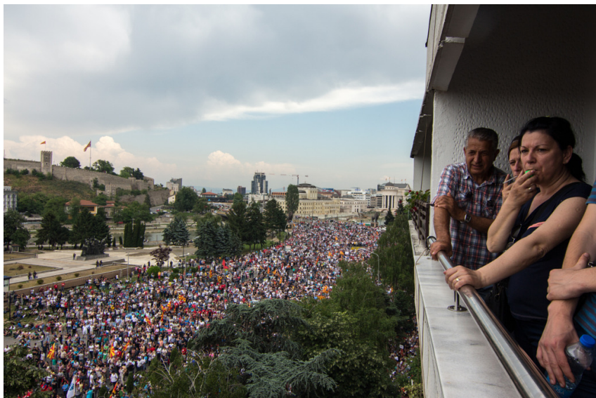
Woman with whistle at the balcony - Skopje, 17.05.2015

Recent Social Movements from the Region such as the Colourful revolution in Macedonia, the Plenums of Bosnia Herzegovina and the manifestations against Belgrade Waterfront Development or in front of the Public media in Novi Sad were present through the participation of some of their main actors, but also thanks to a photo exhibition which included photographers ranging from young amateur photographers to established professional photojournalists. Photos are visible online here